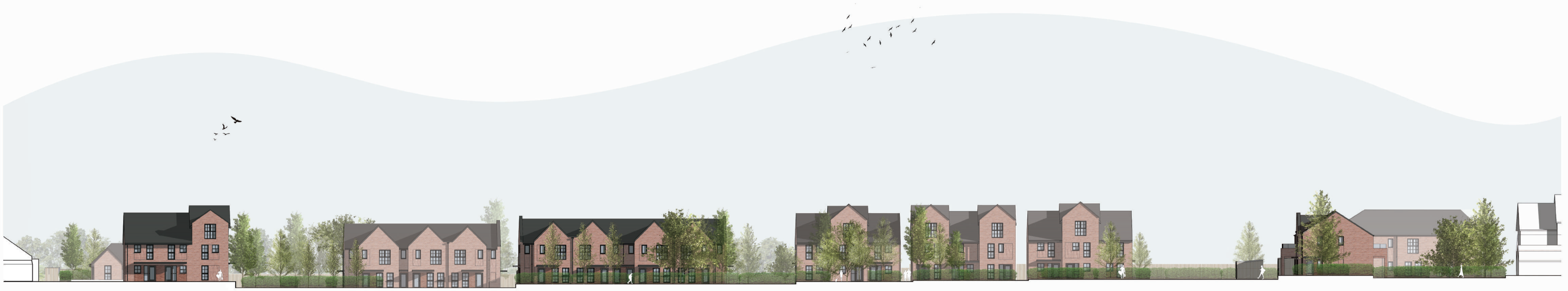
Proposed Street Scene A-A (Netherfield Lane) 1:250